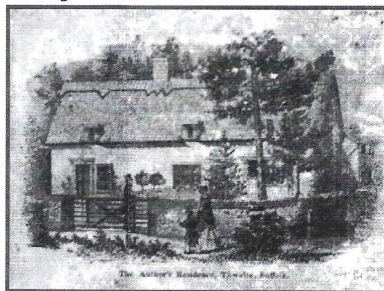
The Author's Residence Print By Orlando Whistlecraft